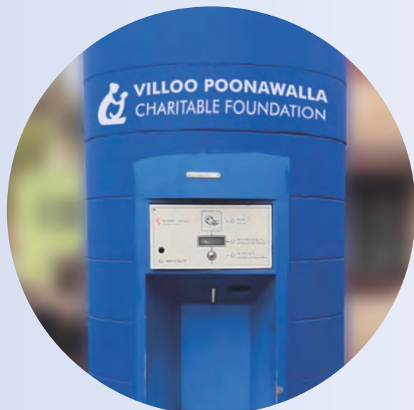
Clean Drinking Water