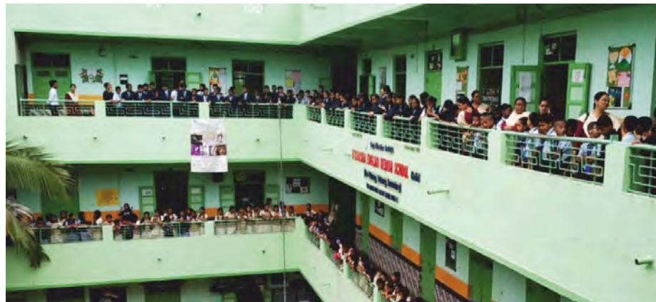
Viloo Poonawalla English Medium School (CAMP)