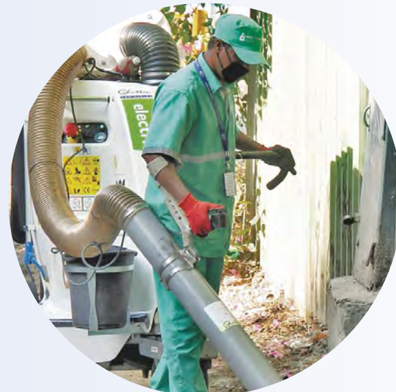
Clean City Drive