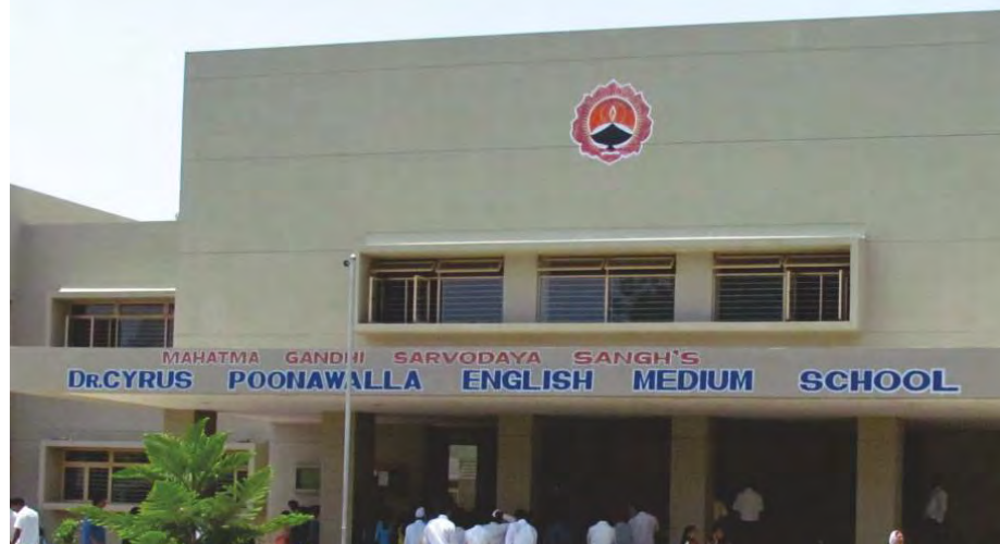
Dr. Cyrus Poonawalla English Medium School (URULI KANCHAN)

10. Utkal Gaurav Foundation (First school being built in Berunapadi village, Odisha) Utkal Gaurav aims to provide holistic learning to more than 200 kids in Odisha and impart moral and spiritual values. Utkal Gaurav is set to build centers of excellence in the fields of Music, Dance, Yoga, Sports, and Theatre for the wholesome development of the kids in the coming months.