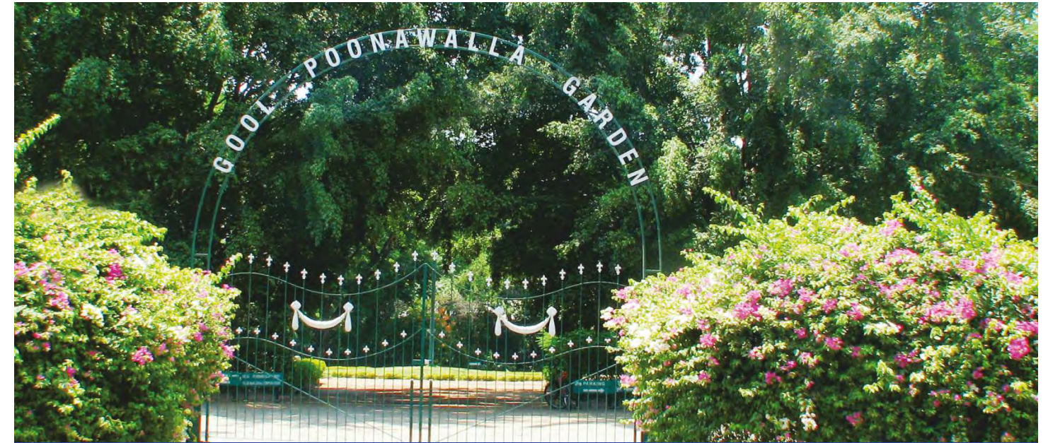
Gool Poonawalla Garden, Pune