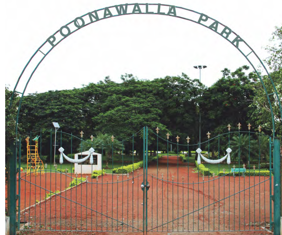
Poonawalla Park, Baramati

Parks are a tangible reflection of the quality of life in a community. They provide identity for citizens and are a major factor in the perception of quality of life in a given community. Parks and recreation services are often cited as one of the most important factors in surveys of how livable communities are. Parks provide gathering places for families and social groups.